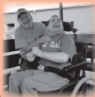
All-Star Ranch Hayride & Picnic