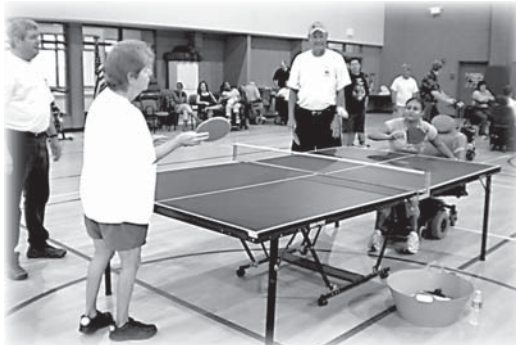
We appreciate those who participated and made the 2010 Day of Caring a day where all were winners!